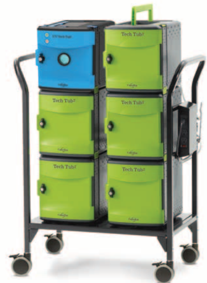
Tech Tub 2 ® Modular Cart with UV Tub Charges 26 devices