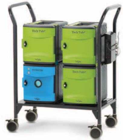
Tech Tub 2 ® Modular Cart with UV Tub Charges 18 devices

****If you remove your UV tech Tub from the Modular Cart, do not place the UV Tech Tub on the floor. Only place the UV Tech Tub on surfaces that are at least 30" above the floor. This is to prevent accidental collisions that can cause damage or injury from impact and tip over.