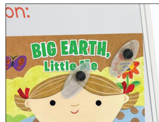
Magnetic Page Paws hold big book pages