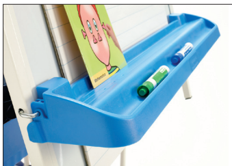
Ultra-Safe adjustable premium book ledge