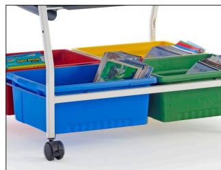
Slide out tubs with safety stops (tubs are made from recycled material)