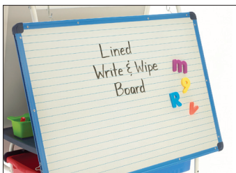
Rear removable and adjustable dry erase board (lined one side)