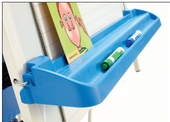
Ultra-Safe adjustable premium book ledge