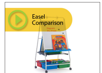
Watch the comparison video on Youtube www.youtube.com/copernicuseducation