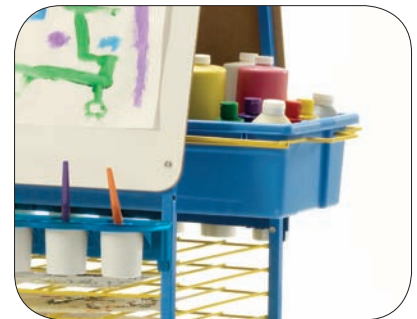
Sliding Really Big Tub to hold all your art supplies

For further details, please visit our website or contact Customer Service. www.copernicused.com 1 800 267 8494