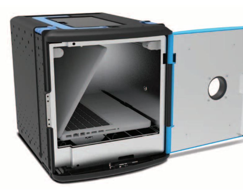
Can hold open laptops to sanitizes the most germy surfaces: the keyboard and screen