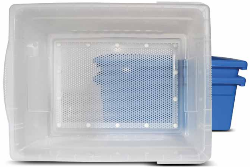
Kit shown (SAN-TUB1)

Our tubs have been tested with Caviwipes (medical grade disinfection wipes) and bleach diluted to 2:10