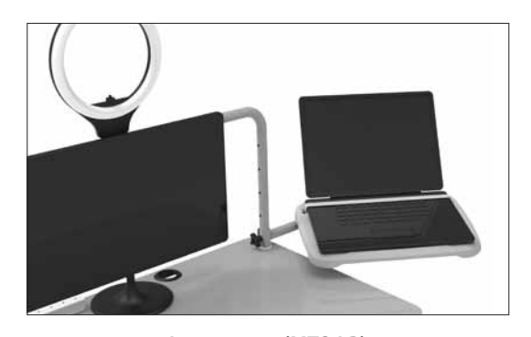
Laptop tray (MTS-LP) Holds up to a 17" laptop and is height adjustable. Add to one or both sides of the station.