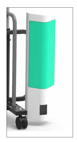
FrontRow Juno Speaker Mount (MTS-SPK) Improve the sound quality of recordings and projection within the classroom (speaker sold separately).