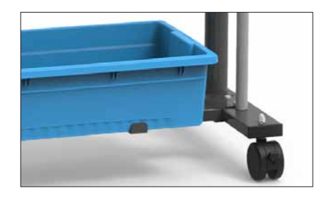
Really Big Tub Kit (MTS-RBT) Primary teachers can store larger props and books to keep them within reach.