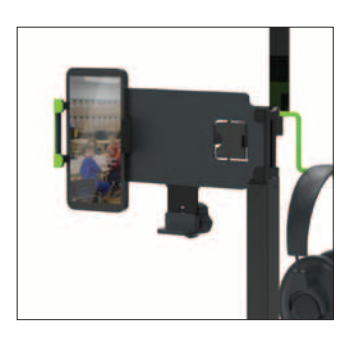
Spring loaded clamp also holds smartphones

With the addition of a microscope, Dewey enables students to get up-close and explore their studies. Microscope feature has 5x or 10x magnification and LED light.