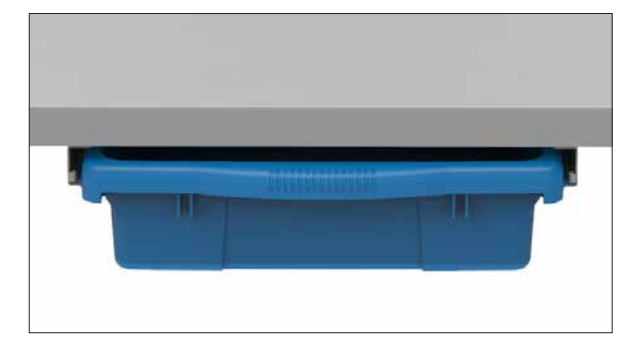
Stubby Tubby Pull-out Drawer (MTS-STB) A handy spot to store small items to help keep the desktop clear for demonstrations.