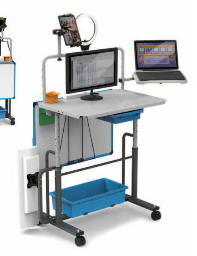
Mobile Tech Station Premium Model shown with optional Frontrow Juno speaker mount (in standing position)

Lifetime on cart components 1 year warranty on ring light 5 year warranty on whiteboards