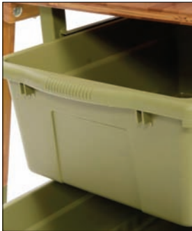
4 sliding Open Tubs with safety-stops

Designed to bring natural elements into the classroom, Bamboo Teaching Easels are ideal for neutral or early year environments.