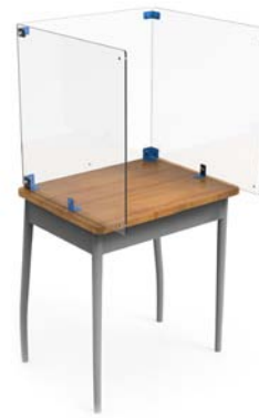
U-Shaped can be used for group tables or student desks (DIV-U)