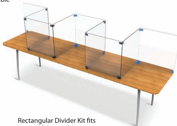
Rectangular Divider Kit fits 10ft long tables (DIV-RECT)