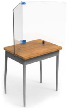
V-Shaped can be used for group tables or student desks (DIV-V)