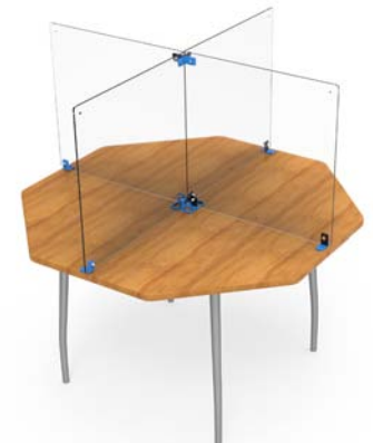
X-Shaped fits 48" rectangular, square or octagon tables (DIV-X)