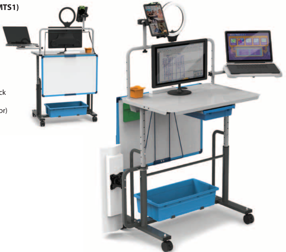
Mobile Tech Station Premium Model shown with optional Frontrow Juno speaker mount (in standing position)

Lifetime on cart components 1 year warranty on ring light 5 year warranty on whiteboards