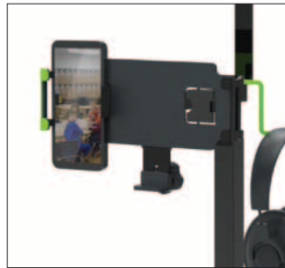
Spring loaded clamp also holds smartphones

Dewey is also helpful to teachers if they suddenly have to teach remotely and with hybrid models.