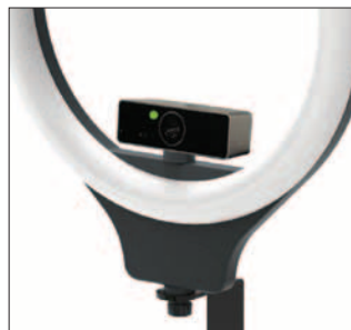
Small webcams can be attached to the ring light (4" W x 1" H)