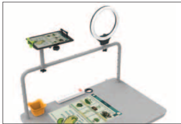
Dewey Doc Cam positioned to show the desktop

Same feature as the premium model but without the laptop tray, whiteboard and storage options.