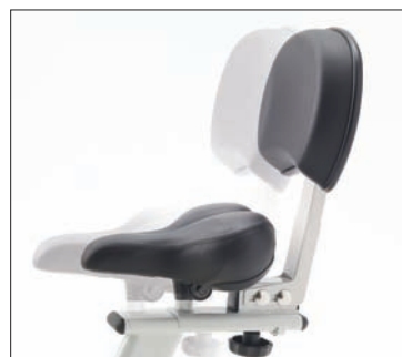
Fully adjustable seat and backrest (requires no tools) SCC100 and SCC200 have backrest