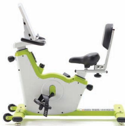
Model with work surface and backrest (SC100)