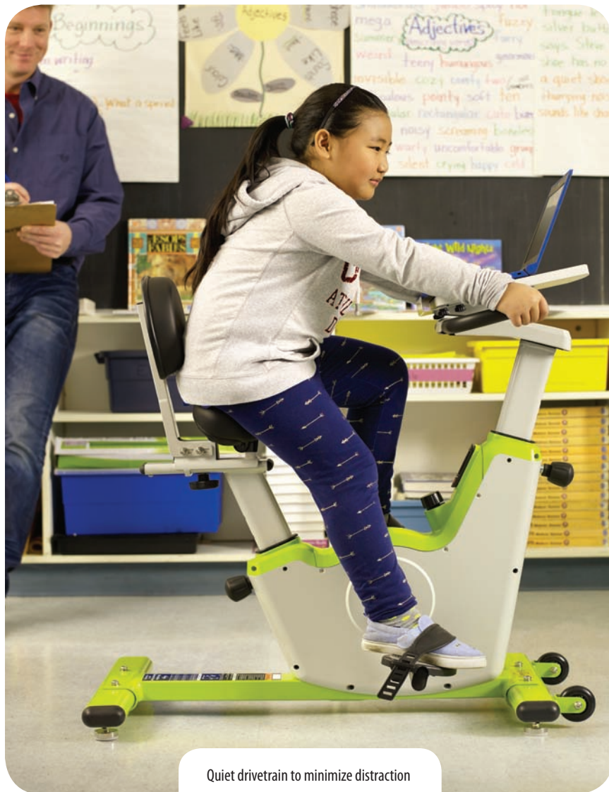
Quiet drivetrain to minimize distraction