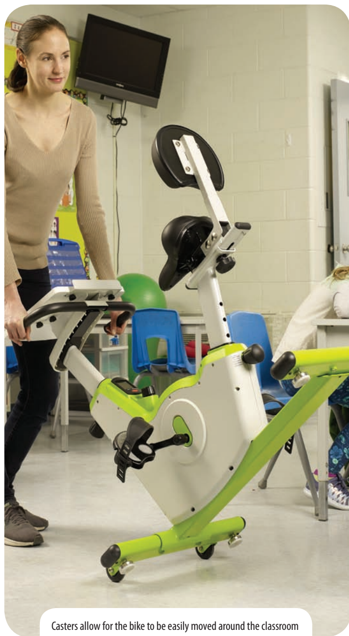
Casters allow for the bike to be easily moved around the classroom