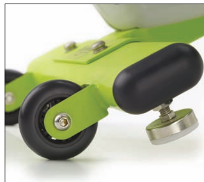
Levelers ensure that the bike sits evenly on floor and casters make moving easy