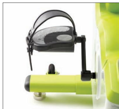
Pedals include adjustment straps for added grip and safety