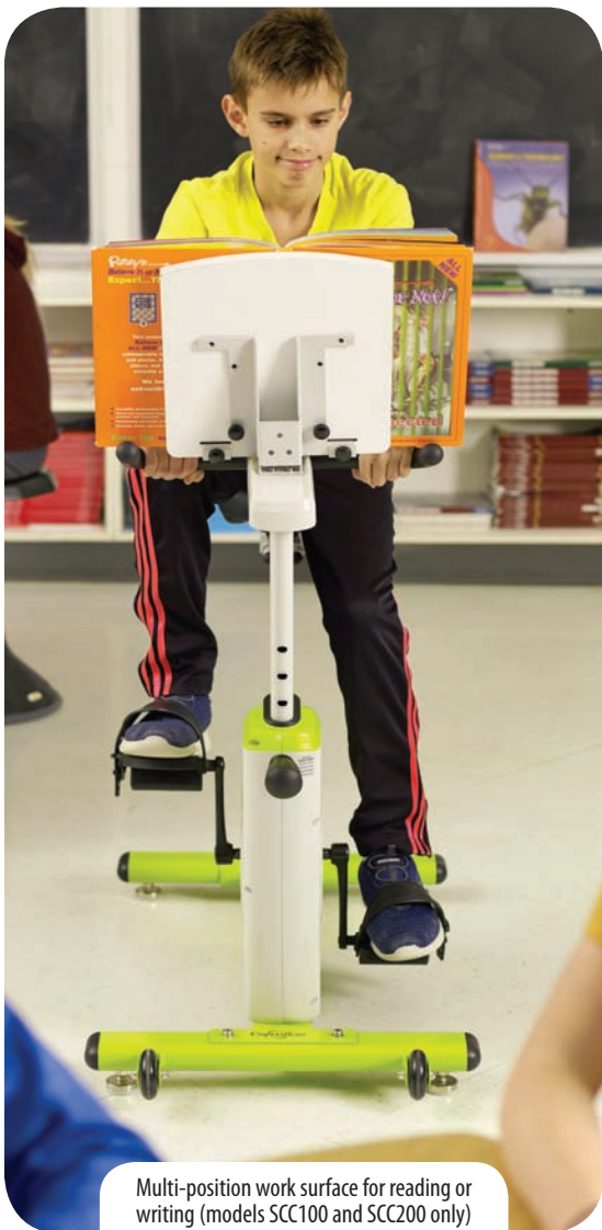
Multi-position work surface for reading or writing (models SCC100 and SCC200 only)