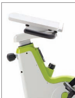
Work surface in writing position (SC100, SC200)