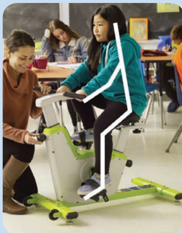
Designed with ergonomics specifically for student-sized riders