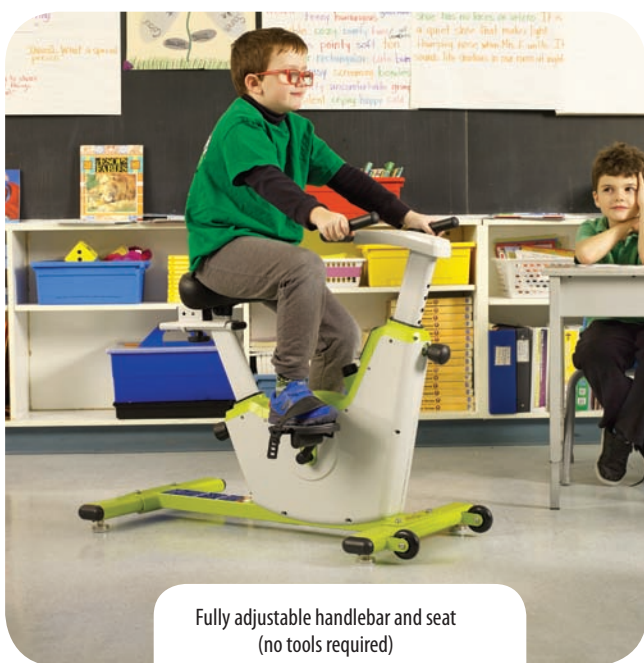
Fully adjustable handlebar and seat (no tools required)