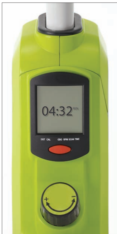
Built-in display to track distance, speed, time, RPM and calories burned (batteries included)