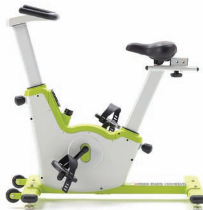
Model without the work surface and backrest (SC202)