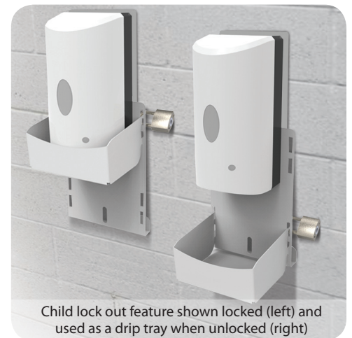
Child lock out feature shown locked (left) and used as a drip tray when unlocked (right)