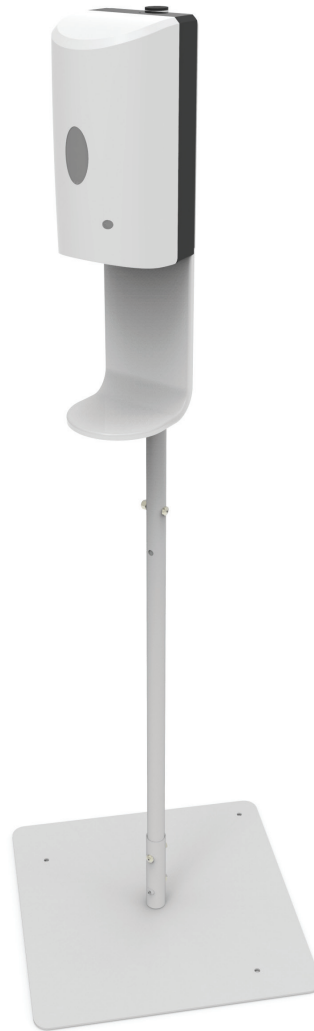
Hand Sanitizer Stand (SAN001)