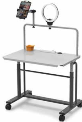
Shown in seated position (adjustable during assembly)