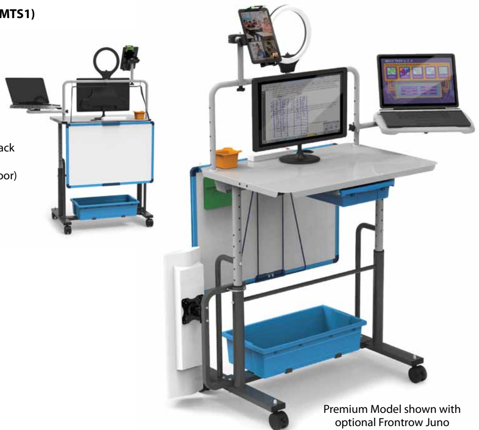
Premium Model shown with optional Frontrow Juno speaker mount (in standing position)

Lifetime on cart components 1 year warranty on ring light 5 year warranty on whiteboards