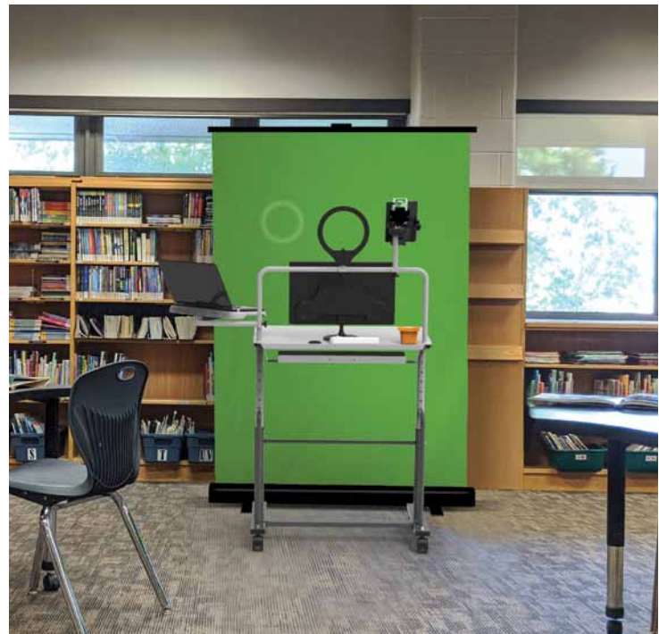
Set up in a media center for students to record and stream video

Customize the station with these optional add-ons to suit grade level, subject or tech being used