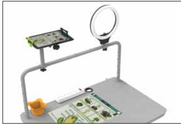
Dewey Doc Cam positioned to show the desktop

Same feature as the premium model but without the laptop tray, whiteboard and storage options.