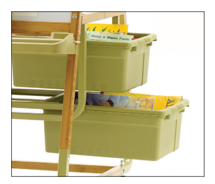
4 sliding Open Tubs with safety-stops