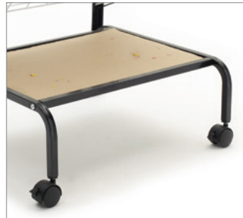
Removable paint drip tray (cardboard)