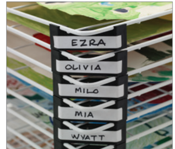
Personalized rack spacers