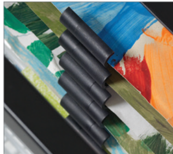
Paper catch clips