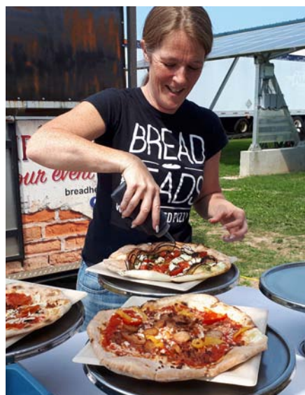
Pizza Party luncheon!