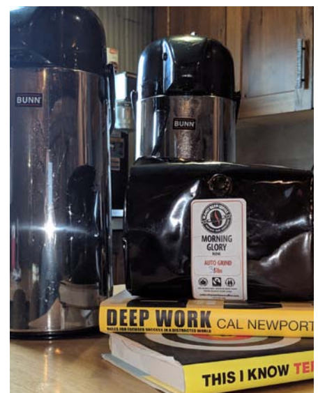
Copernicans can take advantage of our Fairtrade coffee and book program