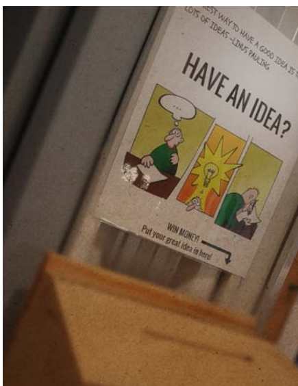
Every employee is encouraged to submit their ideas in the company Suggestion Box