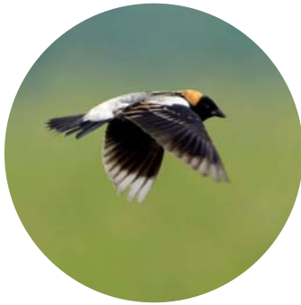
Protected grassland are currently home to threatened species such as the Bobolink songbird and the Monarch Butterfly

George farmed the land for many years but once he started Copernicus Educational Products, he and his son, Jim, began to naturalize it in the early 1990's. Since then they have planted over 60,000 trees. In 2018 we undertook a wetland restoration project at the back of the property through the conservation organization Ducks Unlimited. This 100 acres, in conjunction with other lands purchased by Copernicus, totals 550 acres of land that is protected in perpetuity. Land conservation is important to us because we know that the world's wildlife and natural spaces are at risk due to increasing development and human influence. If we don't protect wilderness while it still exists, it won't be long until it's gone for good.