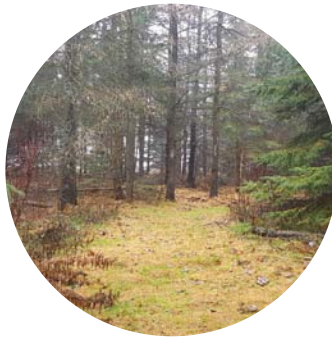
The Copernicus Nature Trail