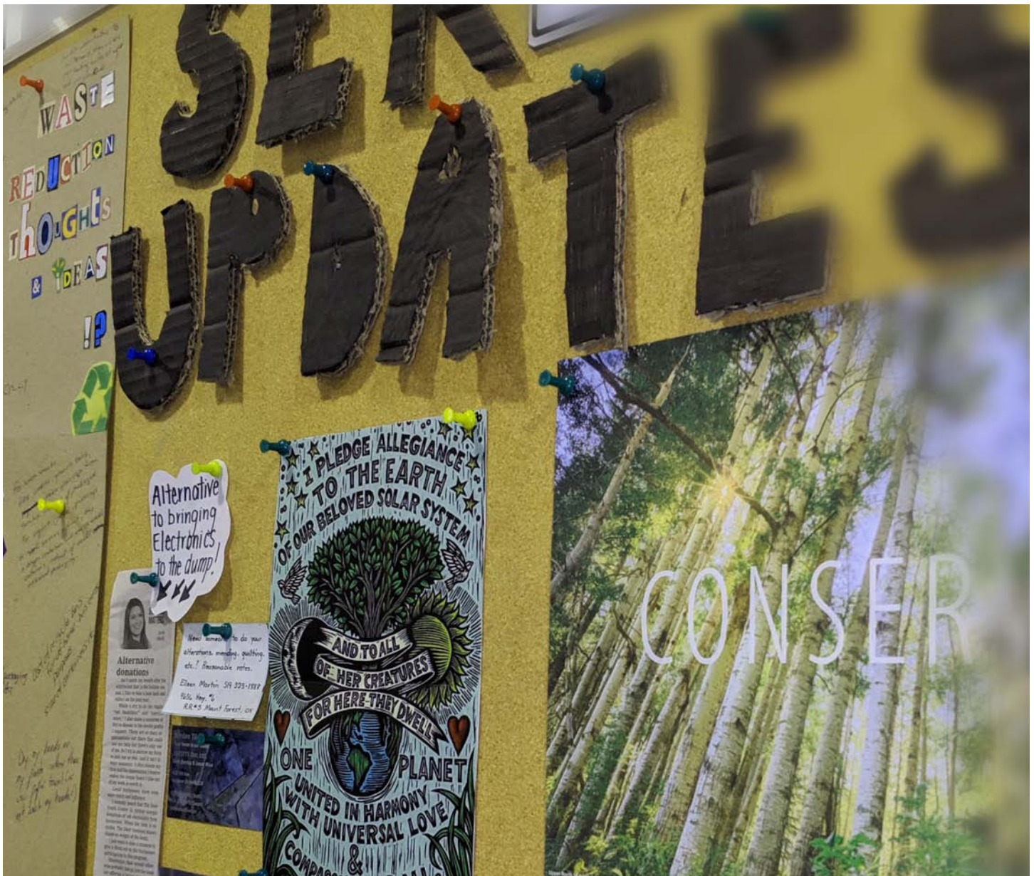
SER employee notice board