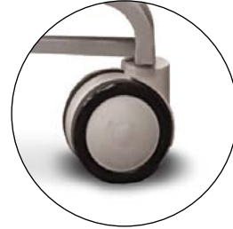
Our carts have durable 5" casters

Teachers tell us all the time that casters matter. Our Idea Lab Educator Advisors told us they rearrange their classrooms monthly and some even bimonthly. With that kind of travel it is worth knowing you have a durable cart and caster to protect the investment of an expensive flat panel.